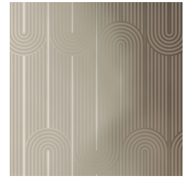
28-04 Parchment Shimmer