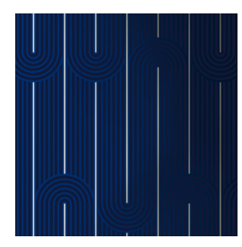
28-15 Blue Diode Shimmer