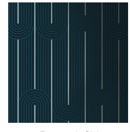
28-14 Peacock Shimmer