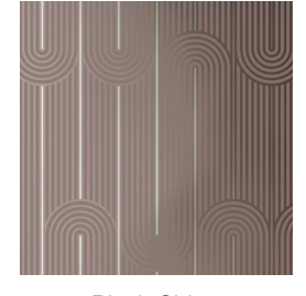
28-06 Blush Shimmer