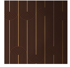
29-08 Mahogany Gold Chrome 28-09 Mocha Shimmer