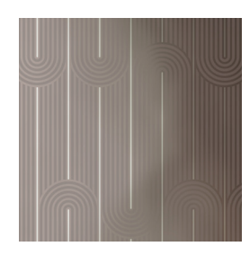
28-05 Ballet Shimmer