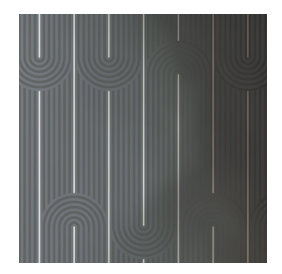
28-11 Silver Shimmer