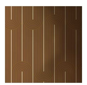
28-19 Rust Shimmer