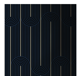
29-16 Midnight Gold Chrome