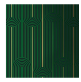
29-13 Emerald Gold Chrome