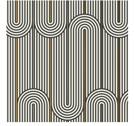
29-02 Black+White Gold Chrome 29-03 Gold Shimmer