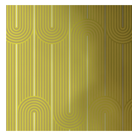
28-12 Bumble Bee Shimmer