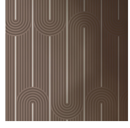
28-07 Walnut Shimmer