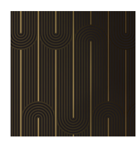
29-17 Tobacco Gold Chrome