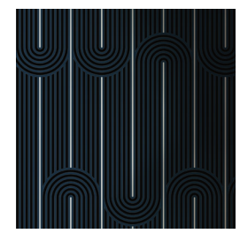
28-17 Galaxy Shimmer