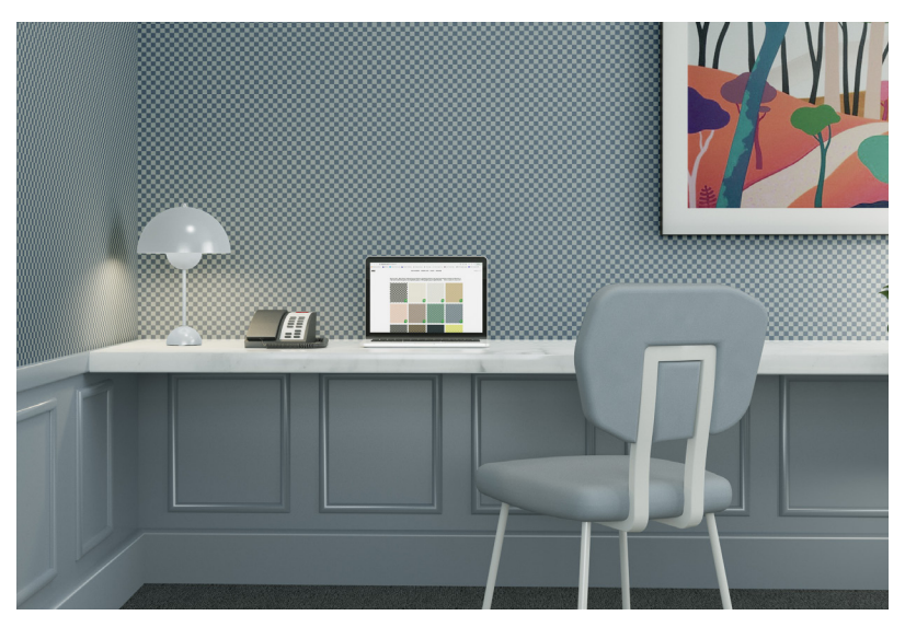
Rendering of Mini Check in Slate ECO