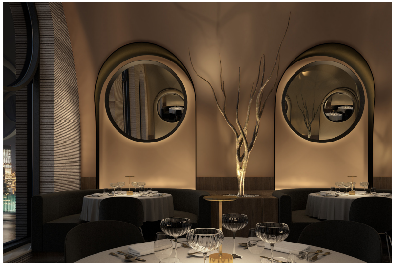
Rendering of Lusta in Russet