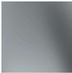
28-11 Pearl Blue