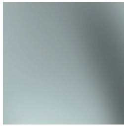
28-12 Sky Blue