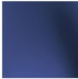
28-13 Blue Diode