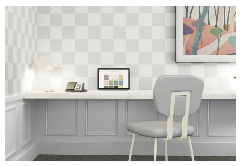
Rendering of Jumbo Check in Cloudy ECO