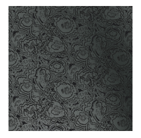
28-06 Navy Shimmer