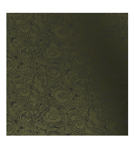
28-01 Parchment Shimmer 28-02 Champers Shimmer 28-03 Golden Shimmer 28-04 Copper Shimmer 28-05 Olive Shimmer