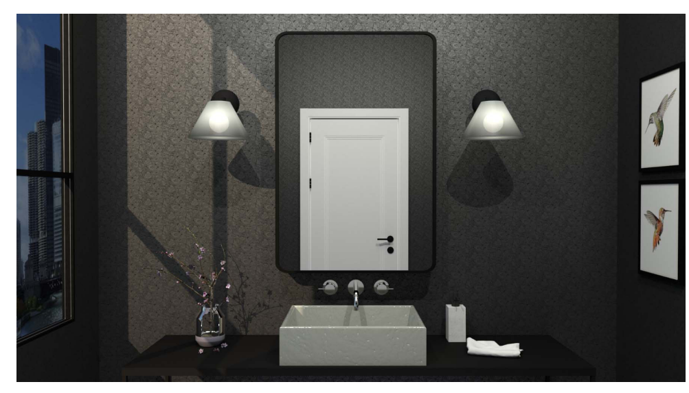
Rendering of Floralish S in 28-07 Silver Shimmer