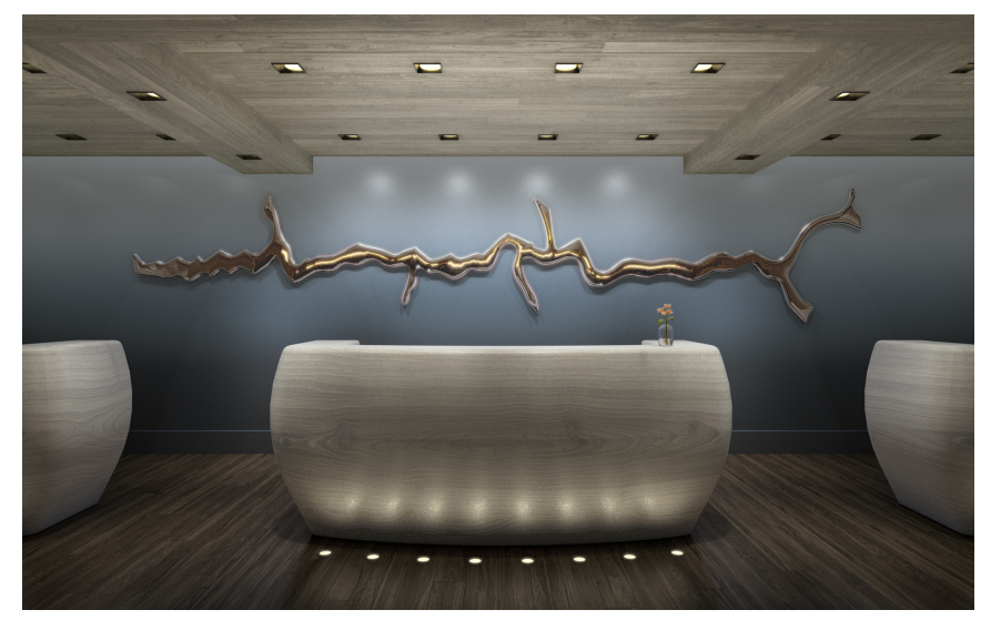
Rendering of Blur Ombré in 19-10 Ocean