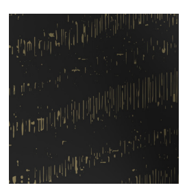
28-15 Antiqued Shimmer

Additional Colorways Available on other substrates