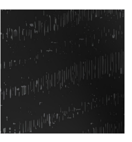
28-10 Icicle Shimmer